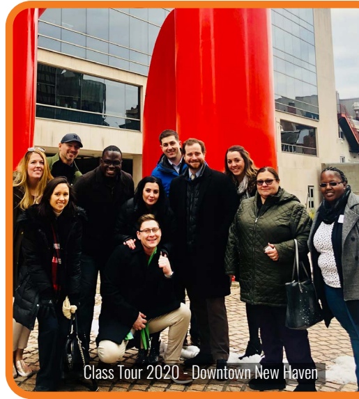
Class Tour 2020 - Downtown New Haven

"Touring and seeing the entrepreneurial workspaces available in Downtown New Haven was eye opening."