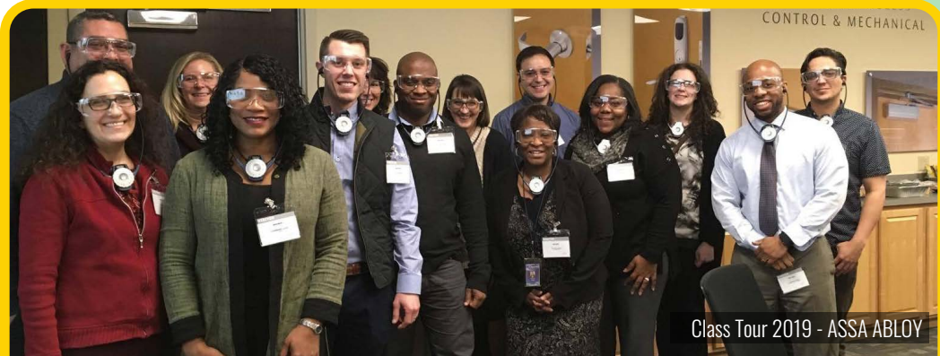
Class Tour 2019 - ASSA ABLOY